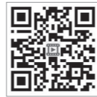
2024 Summer School Highlight Video

where summer begins, 2025 PNU SUMMER SCHOOL