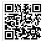
PNU Summer School