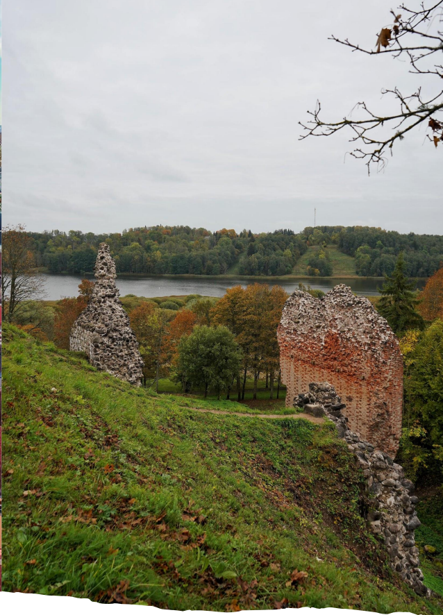
Viljandi and West Estonia (Pärnu, Haapsalu)