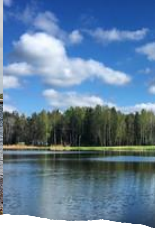
South Estonia (Elva, Valga, Setomaa, Lake Peipsi)