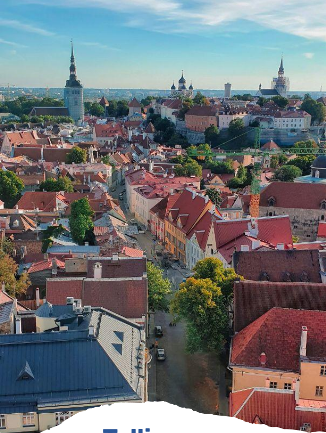
Tallinn and North Estonia