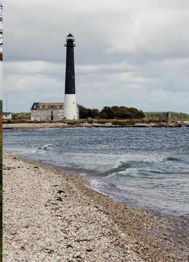
The Islands (Hiiumaa, Saaremaa, Kihnu etc.)